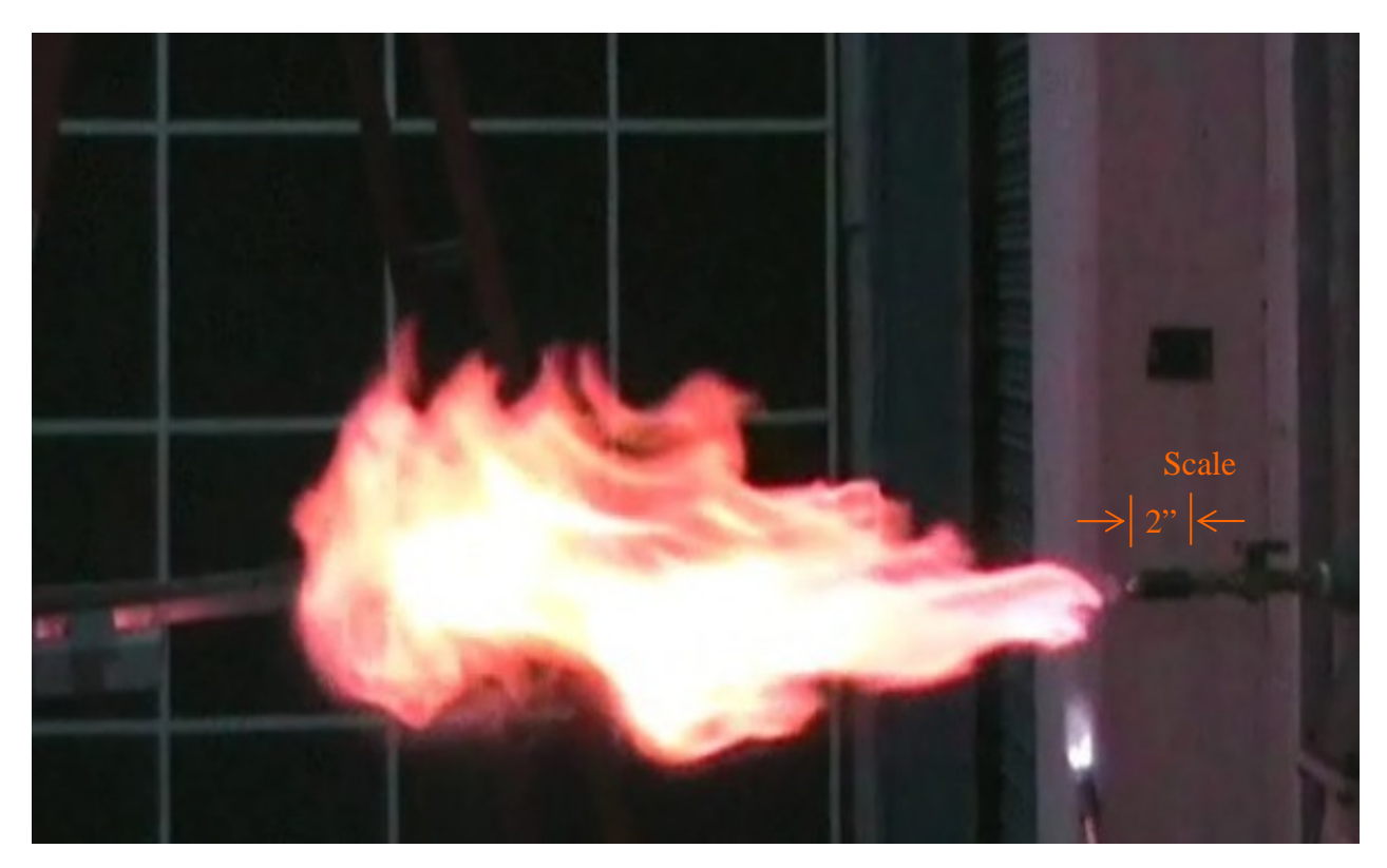
Figure 3. Observed Fire Plume From the Misting of TKS Anti-Icing Fluid in the Presence of an Ignition Source

mist would not continue to burn with the torch removed, and the flame front never traveled back to the nozzle regardless of the pressure or distance at which the torch was applied. When a spark was used as an ignition source, it created some sporadic ignitions of the fluid, but only when the spark was positioned in a small area near the middle of the spray with the high-pressure spray setting.