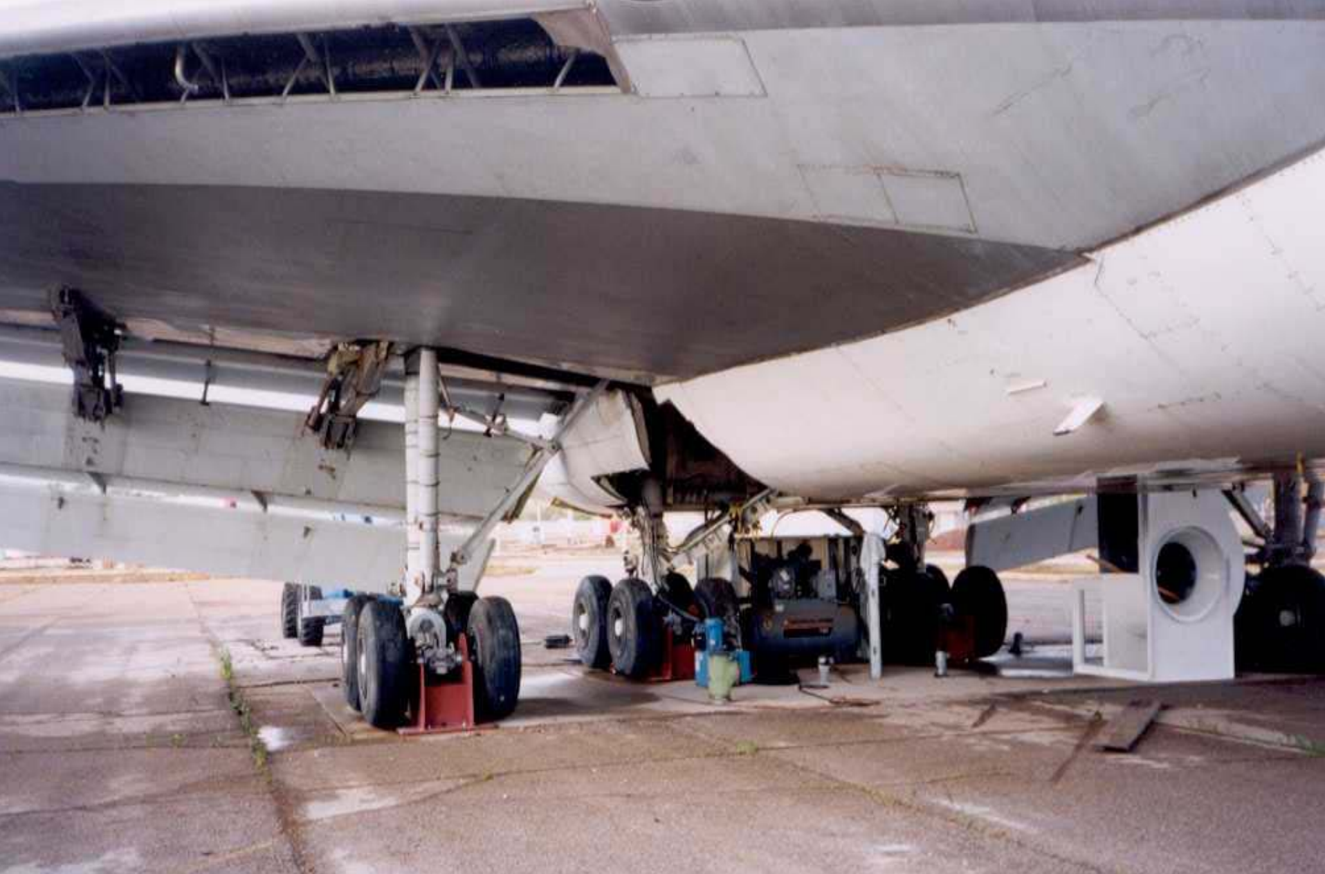
Airframe mounted in position