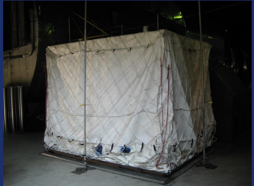
Full scale mockup fire test