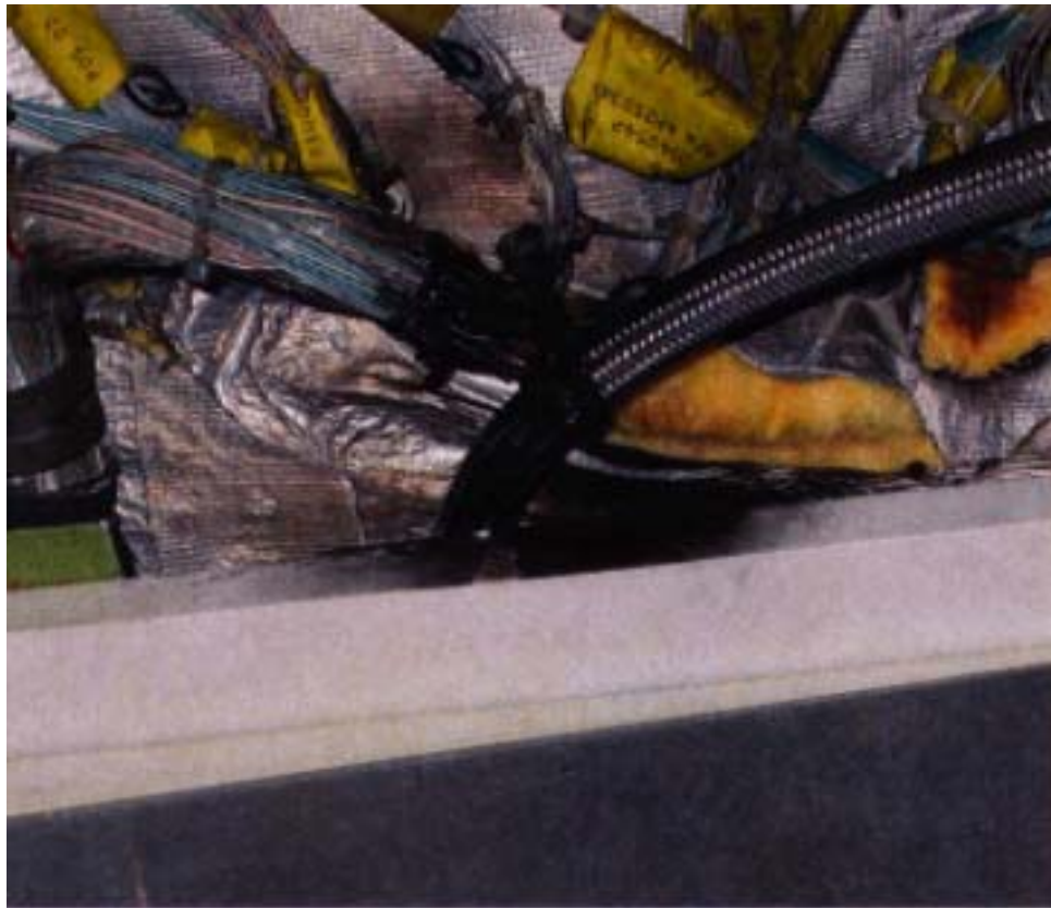
Figure 4 - Detail, B737-436 G-DOCH, 8 November 2002