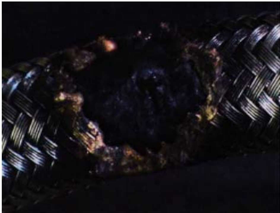
Figure 5 - Water hose damage, B737-436 G-DOCH