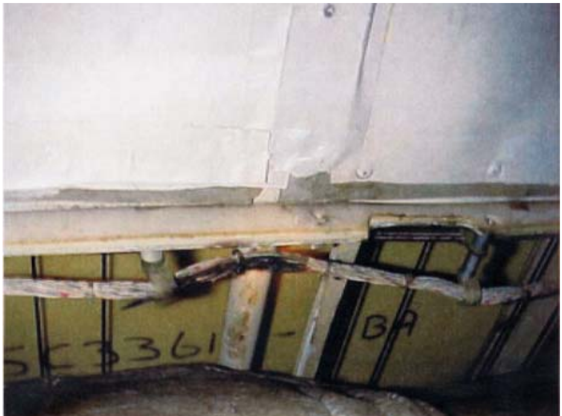
Figure 3 - Detail, B737-436 G-LGTI, 30 May 2003