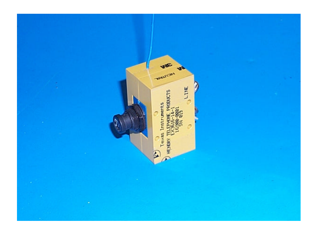
Figure 2. Hendry Telephone Products/Texas Instruments Prototype 400-Hz AFCB

Figure 1. Eaton Aerospace Corporation Prototype AFCBs (Two left breakers are 400-Hz prototypes. Right breaker is a 60-Hz residential breaker.)